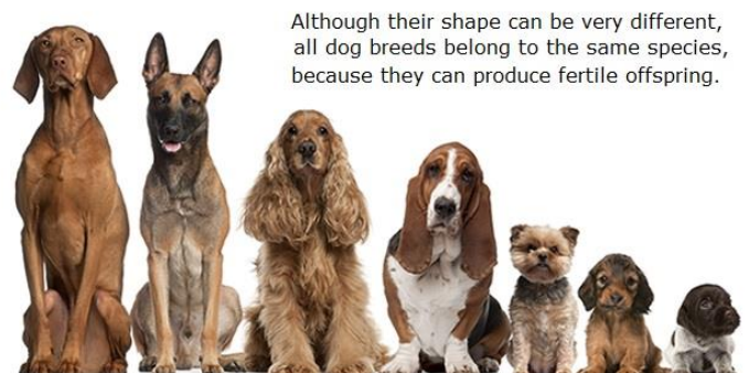
Although their shape can be very different, all dog breeds belong to the same species, because they can produce fertile offspring.

A species is a set of living beings which are physically similar and which can reproduce among them and produce fertile descendants or offspring.