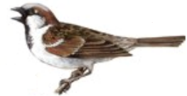
Common name: Sparrow

The species name refers to a characteristic of the species (size, colour, etc) or to the name of its discoverer or to the place where it was discovered.